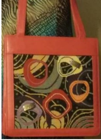
Sterling leather bag finally gets its front stitched by Carmen Puckett.