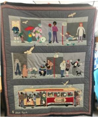
Dodie Stoneburner's two quilts.